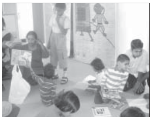
Activity day for our children

conducted a drawing and painting activity. That's not all, our foster parents and children were treated to a delicious lunch.